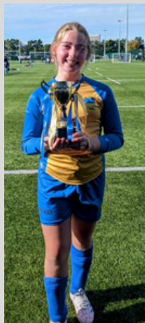
Amazing to see two of our Y3 girls also achieving trophies in football

There are so many achievements at home to share this week! In the first photo you can see one of our Y6 girls who was awarded man of the match trophy for being brilliant on the pitch and scoring the first goal of the season. Fantastic!